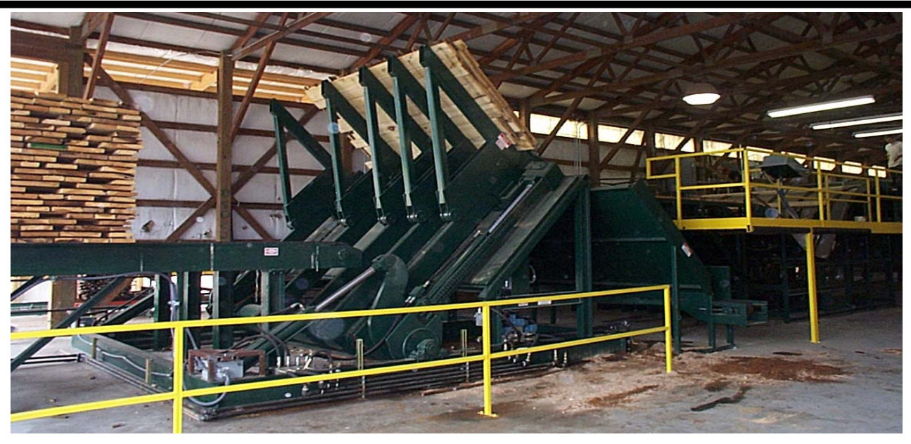
CUSTOM LUMBER HANDLING SYSTEMS